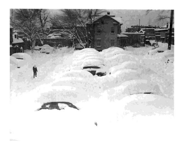
Police Department Parking Lot Dec 27, 1947

And for those of you not old enough to remember the Blizzard of December 26, 1947, this photograph taken out of the window of the police department of the parking lot says it all. Yes, those are cars under the mounds of snow.