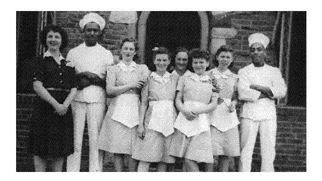
Chimney Corner Staff - 1942

An article a month earlier had added that, in front of this "colonial style" dining room, was a separate luncheonette with a counter and tables.