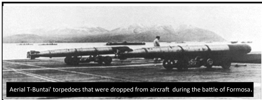
Aerial T-Buntai' torpedoes that were dropped from aircraft during the battle of Formosa.

On the evening of Friday the thirteenth -- after 3 days of bombardment by the big guns of American destroyers and repeated air strikes -- a Japanese