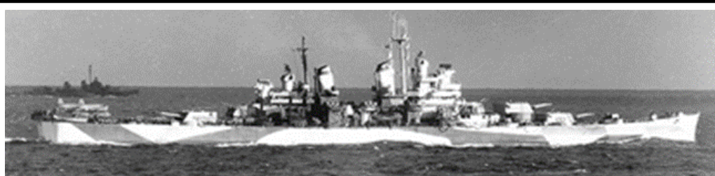
The USS Canberra as she looked in 1944