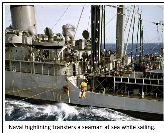
Naval highlining transfers a seaman at sea while sailing.