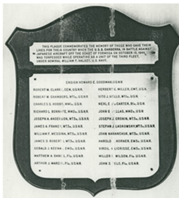
The plaque from the mess hall listing all 23 lost .