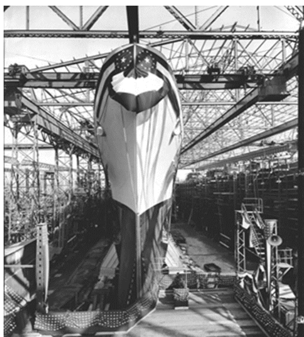
USS Canberra on launching day April 19, 1943.